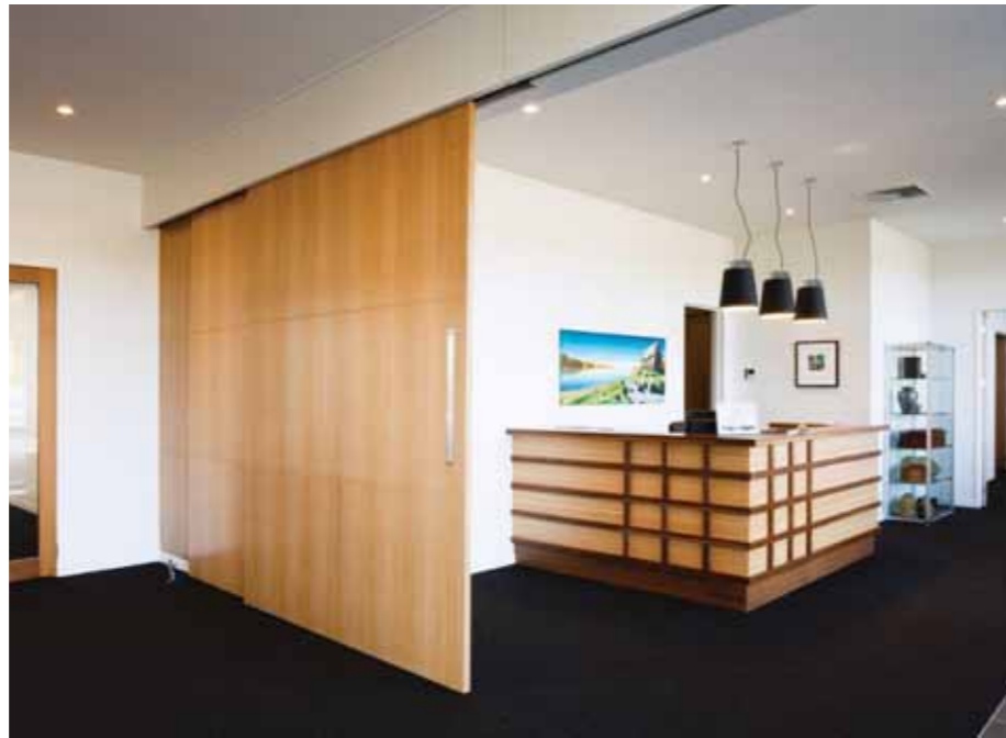
Purpose-designed flexible spaces will allow for multi-use of the foyer and reception areas at any one time, and allow for more privacy. Caterers are well set up with the latest kitchen facilities.

"As you would appreciate, being locally owned is important and employing Hutt Valley companies where possible to complete