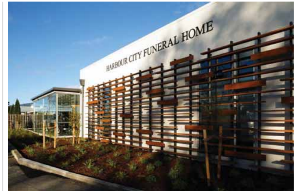
The glass vestibule on the Fergusson Drive side of the new Funeral Home serves to display the funeral carriages, while also allowing undercover weather protection for funerals.

"The new funeral home reflects the company well, it is bright and modern, and the use of lighter colours impresses all who step inside the doors. The facilities are larger, with the new funeral home building tripling in size."