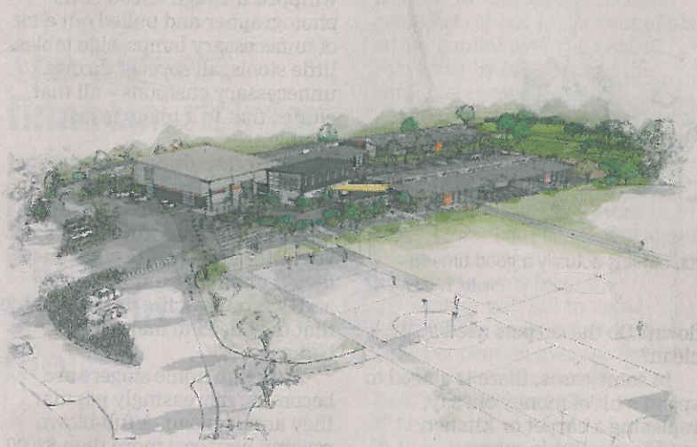
Amesbury School: Another Maycroft job.